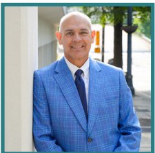
Bruce Thompson Commissioner of Labor

PARAGRAPH (3)(A) of OCGA SECTION 34-8-195